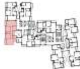
SALEABLE AREA DETAIL