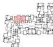
SALEABLE AREA DETAIL