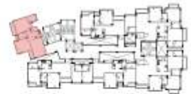
SALEABLE AREA DETAIL