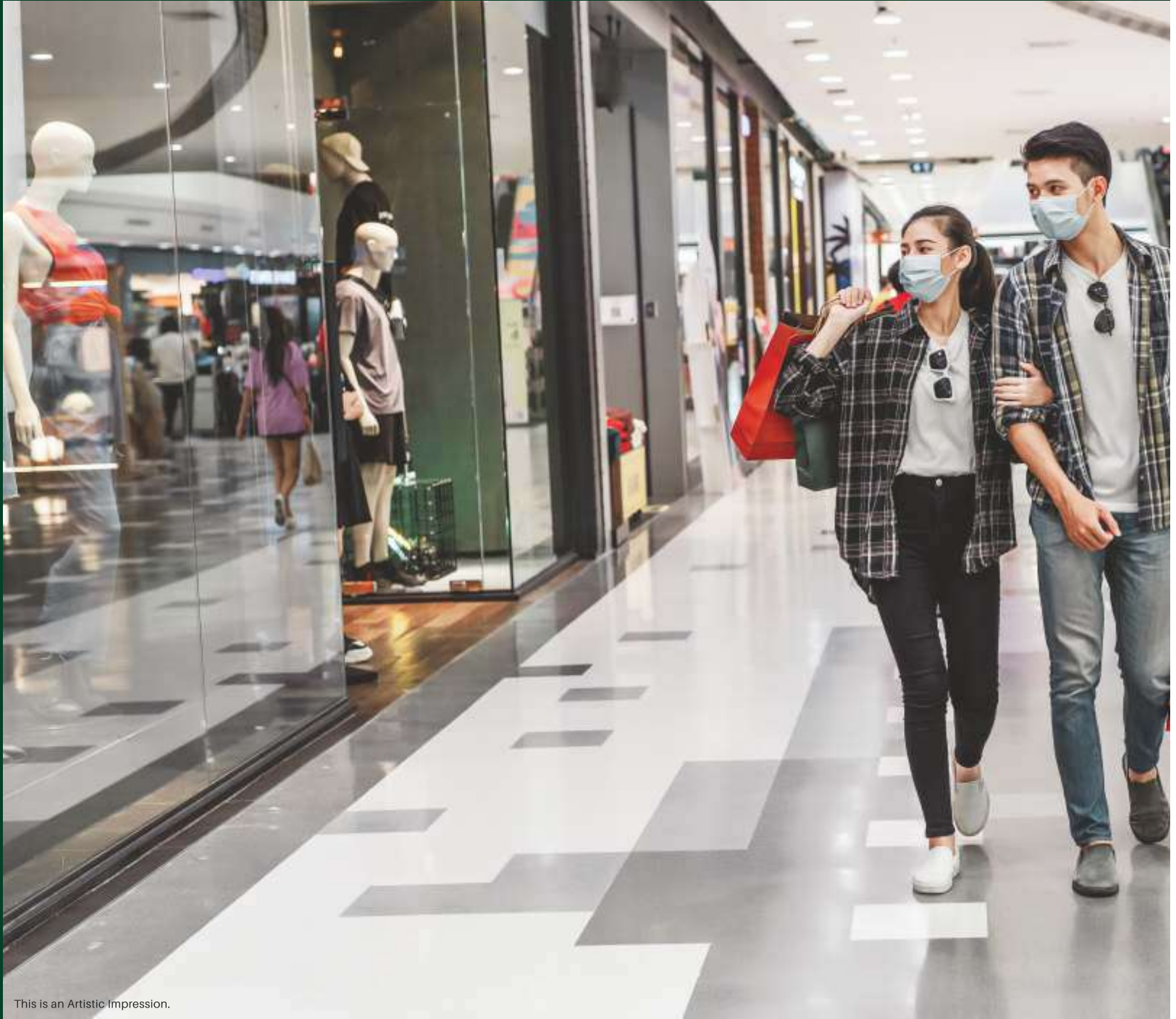
This is an Artistic Impression.