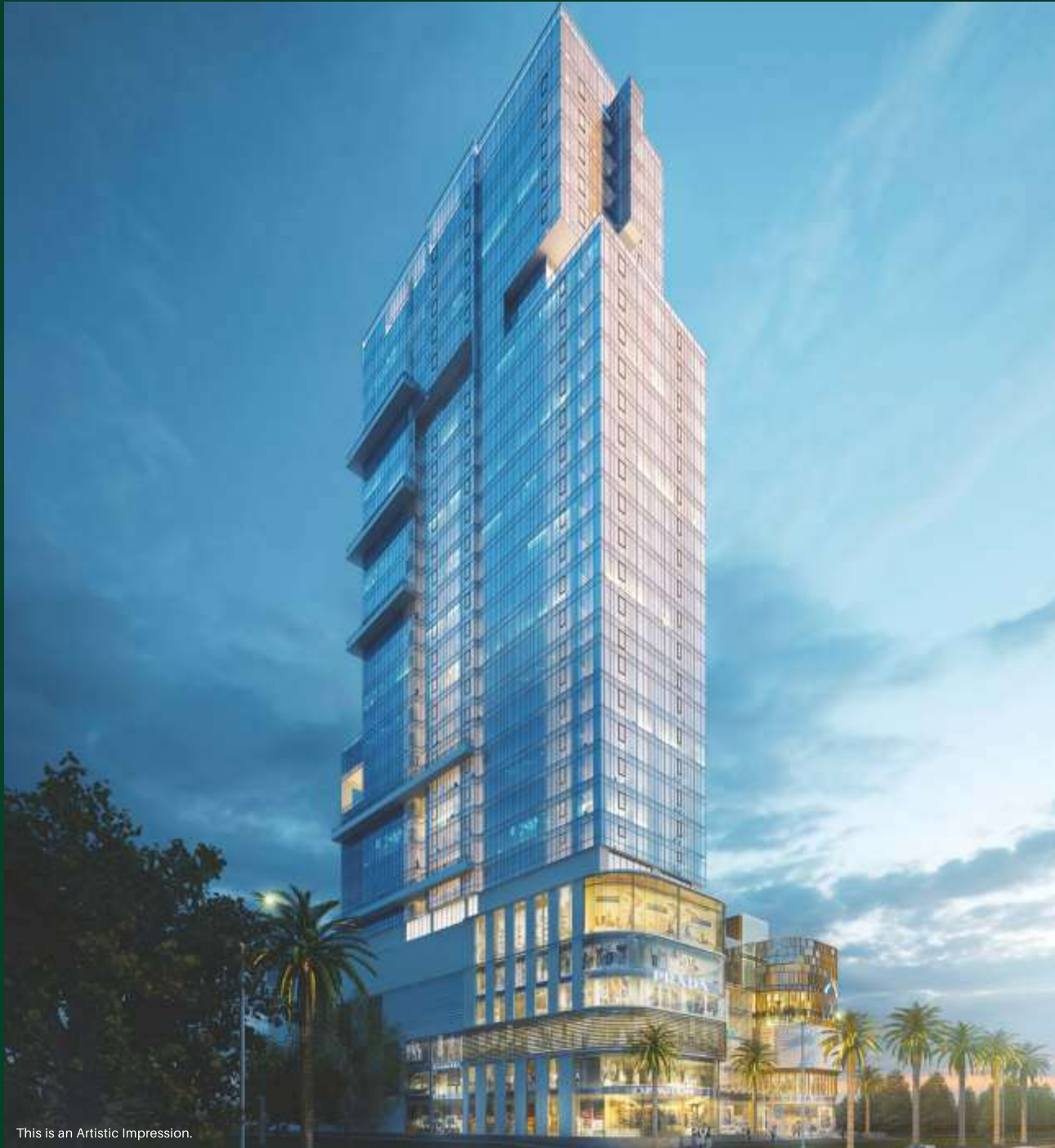
This is an Artistic Impression.