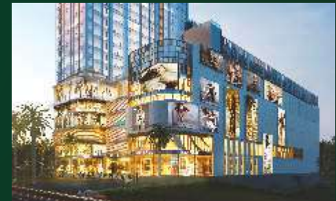
SIKKA-MALL OF NOIDA